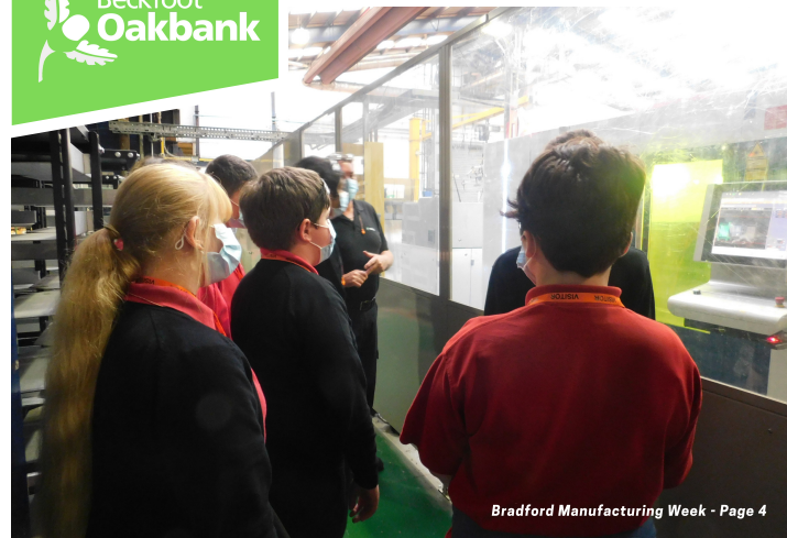
Bradford Manufacturing Week - Page 4