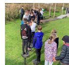
YEAR 7 NELL BANK PHOTOS Page 1