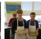
STUDENT LEADERS COOK Page 6