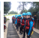
SUMMER SCHOOL CATCH UP Page 3